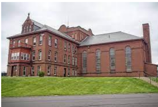
Franklin County House of Correction