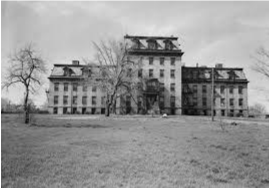
Unidentified Alms House