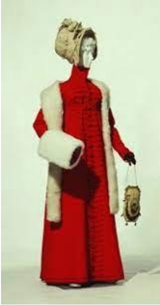
Muff and tippet