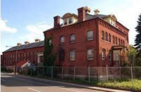
Old Springfield Jail