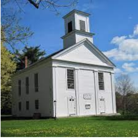
Ware meeting House – Much like Whately’s