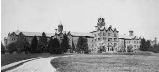
Northampton State Hospital