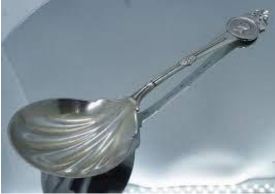
Silver dessert spoon ca. 1860