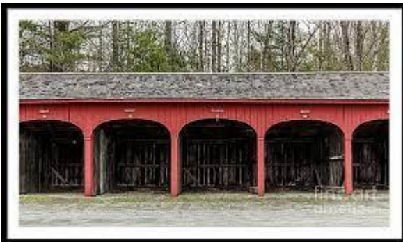
Horse sheds at the Church