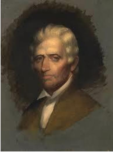
Chester Harding's Portrait of Daniel Boone