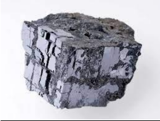
Galena, one of the minerals mined in Whately.