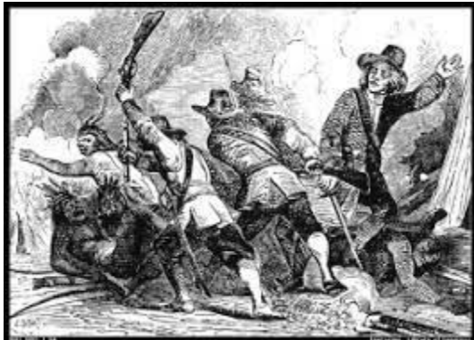
Attack at Hatfield 1677