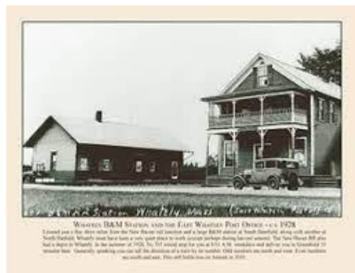
Whately Depot and East Whately Store