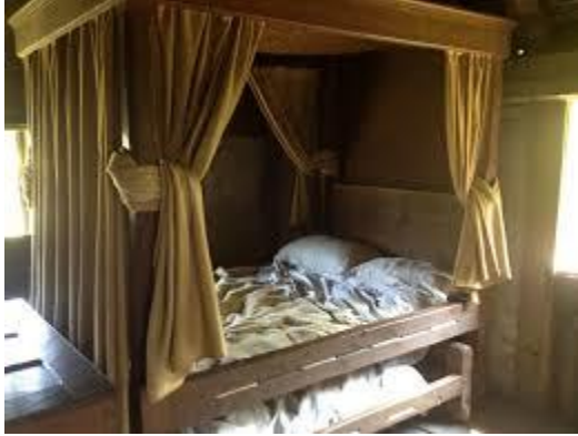
Early Feather Bed