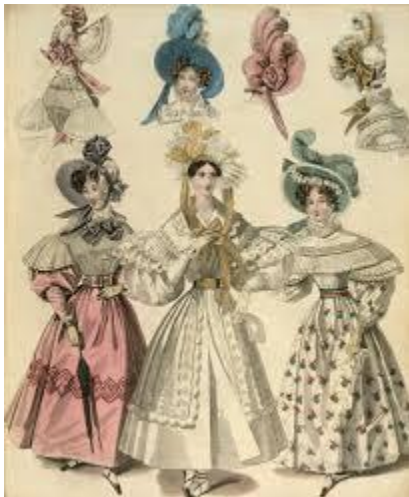
18 th Century Fashion