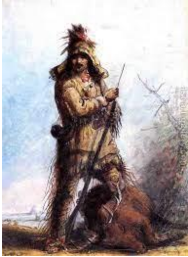
Rocky Mountain hunter and trapper.