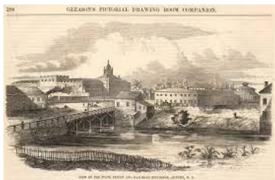
Auburn State Prison, New York