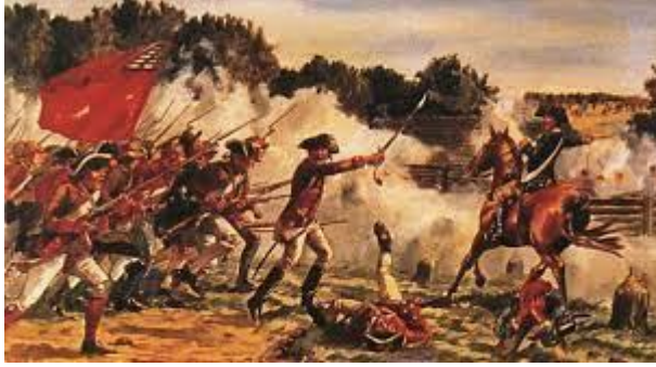
Battle of Saratoga