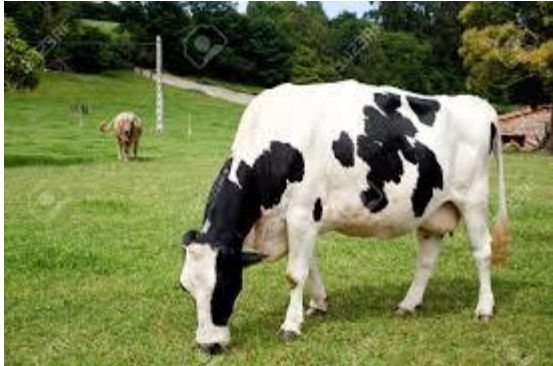
The spotted cow

David , b. 2 Sept. 1813 in Norwich and d. 12 Dec. 1884. 215