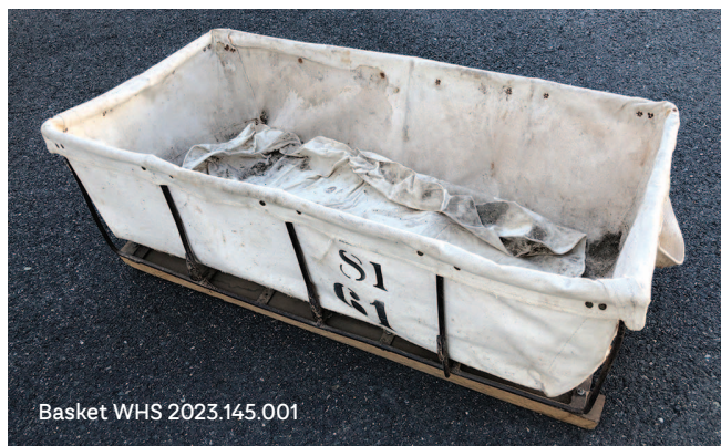
Basket WHS 2023.145.001