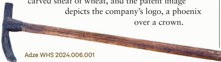
Adze WHS 2024.006.001