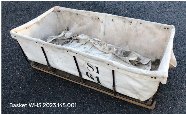
Basket WHS 2023.145.001