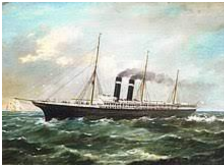
S.S. City of New York