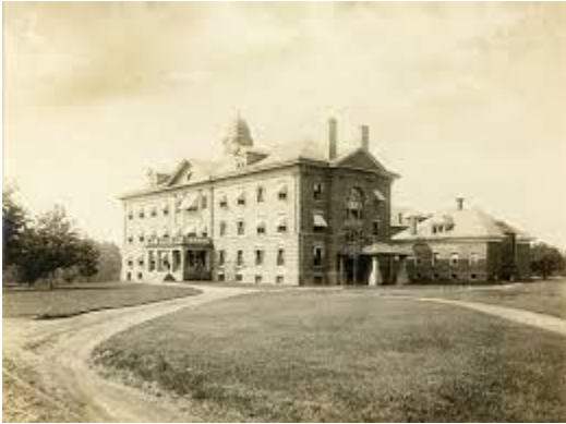
Cooley Dickinson Hospital Northampton