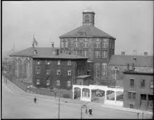
Massachusetts State Prison, Charlestown