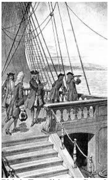
Phip's Expedition to Canada 1690