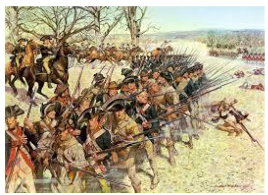
Militia marching to Lexington