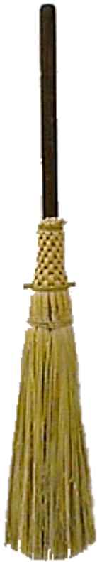
Colonial broom of the type made in Whately