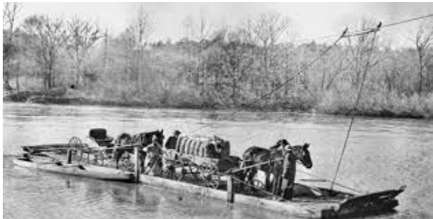
Early Ferry Boat