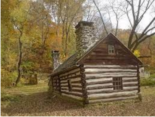
Early Colonial Home