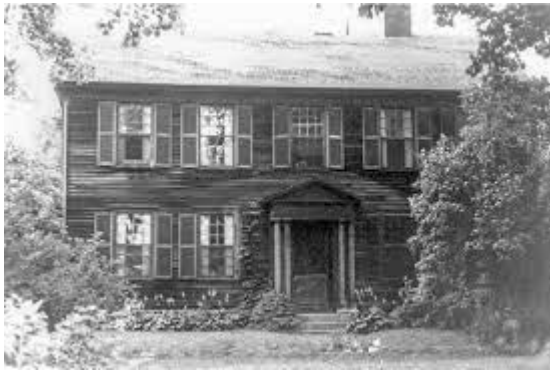
Porter-Phelps-Huntington Museum Hadley