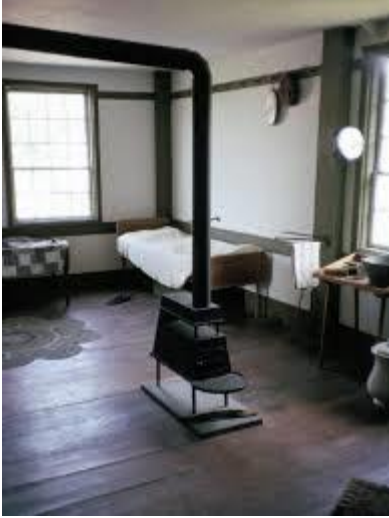
Bedroom Interior Hancock Shaker Village