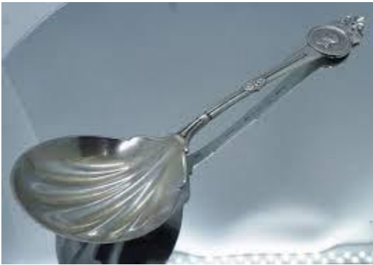
Silver dessert spoon ca. 1860