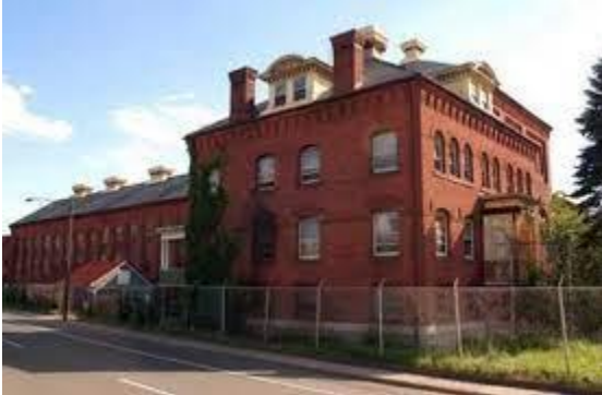
Old Springfield Jail