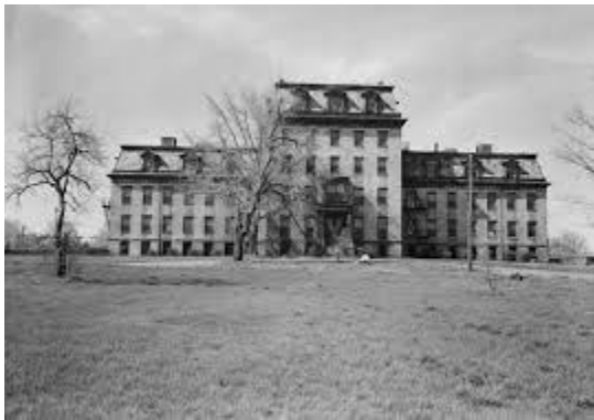
Unidentified Alms House