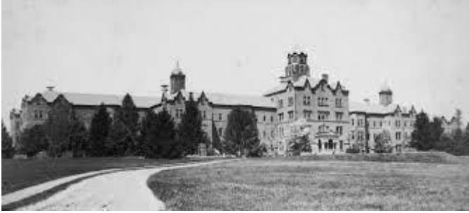
Northampton State Hospital