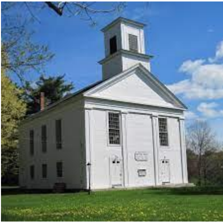
Ware meeting House – Much like Whately’s