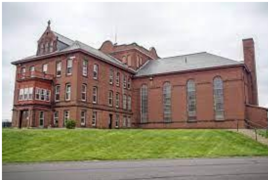
Franklin County House of Correction