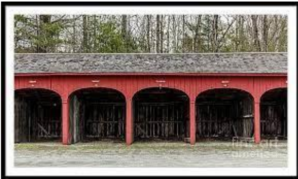
Horsesheds at the Church