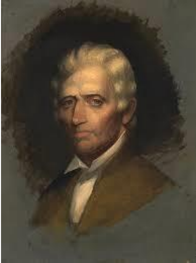
Chester Harding's Portrait of Daniel Boone