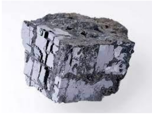
Galena, one of the minerals mined in Whately.