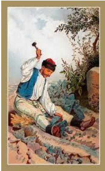
19 th century stone mason