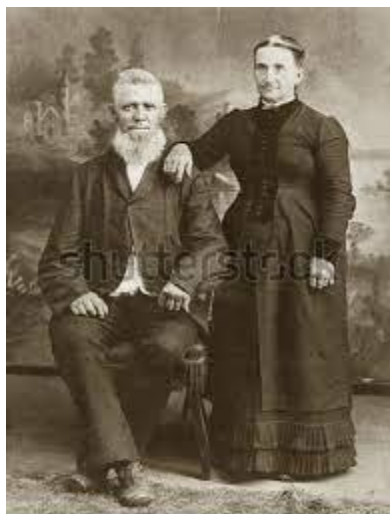
Unidentified elderly couple 1800's