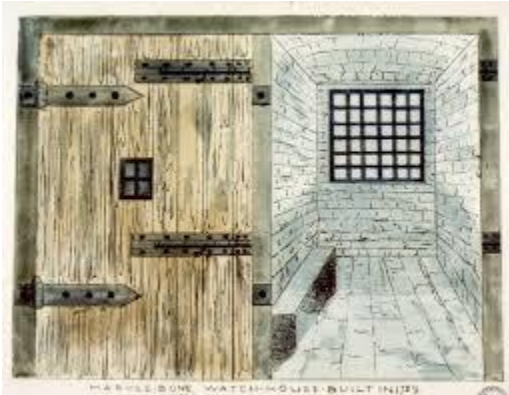
Early prison cell