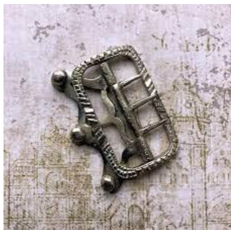
18 th century stockbuckle