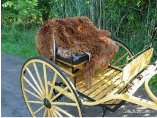
Fur carriage robe