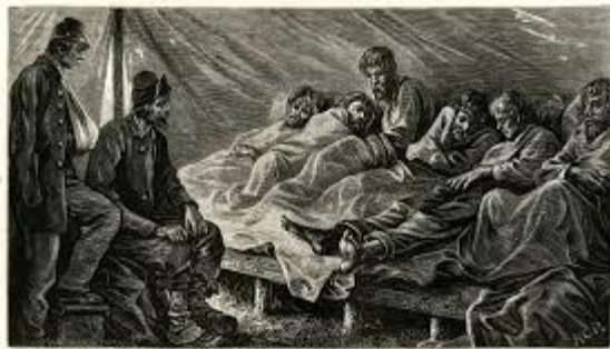
CROWDED HOSPITAL AT ANDERSONVILLE.