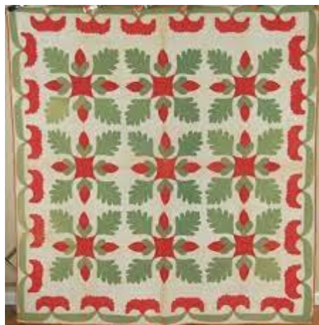
Antique Oak Leaf Quilt