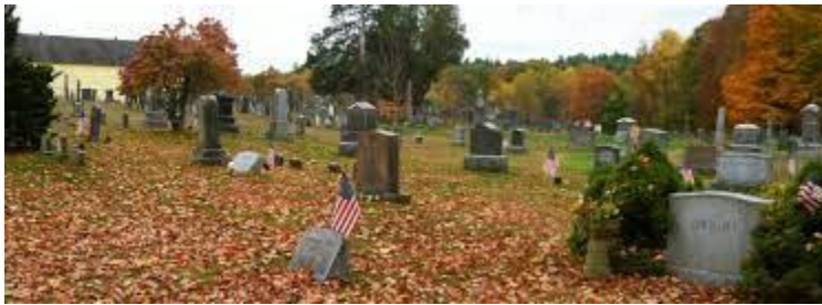
Center Cemetery Whately