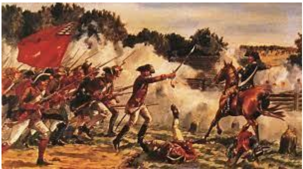
Battle of Saratoga