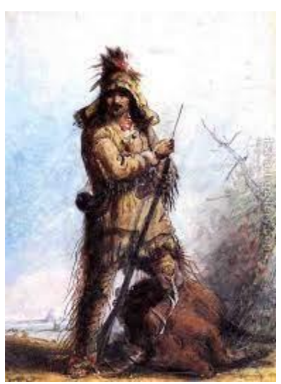
Rocky Mountain hunter and trapper.