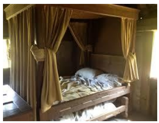
Early Feather Bed