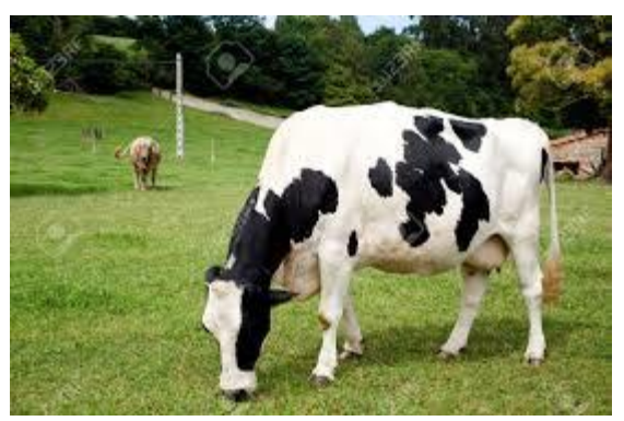
The spotted cow

David, b. 2 Sept. 1813 in Norwich and d. 12 Dec. 1884. 215